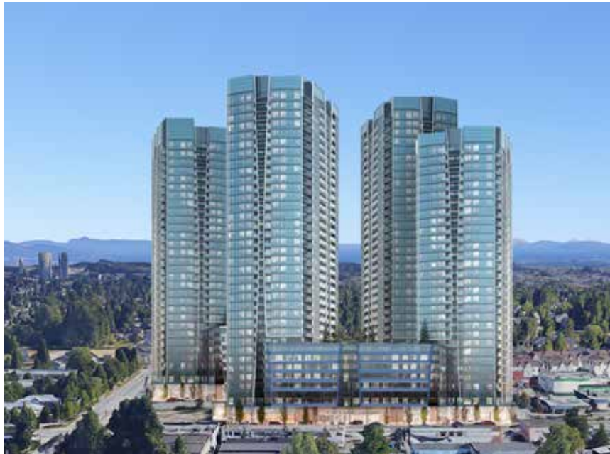
* ARTIST RENDERING FOR ILLUSTRATIVE PURPOSES ONLY, BUYER TO VERIFY REDEVELOPMENT POTENTIAL WITH CITY OF SURREY